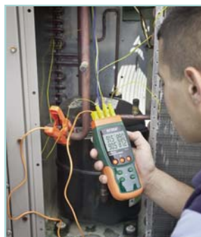
Simultaneously measures 4 temperature inputs for multiple source monitoring