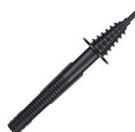
pin probe, black 11 kV (banana socket) WASONBLOGB11