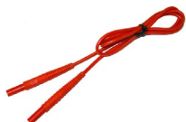
test lead with banana plugs; 1 kV; 1.2 m; red WAPRZ1X2REBB