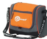
M-6 carrying case WAFUTM6