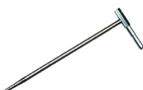
earth contact test probe (rod) 26 cm WASONG26