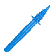
test probe with banana socket; 1 kV; blue WASONBUOGB1