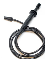
non-contact probe WASONBDOT