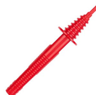
test probe with banana socket; 1 kV; red WASONREOGB1