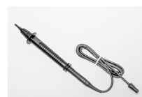
contact probe WASONDOT