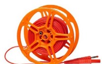
test lead with banana plugs on reel; 1 kV; 20 m; red WAPRZ020REBBSZ