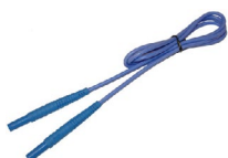
test lead with banana plugs; 1 kV; 1.2 m; blue WAPRZ1X2BUBB