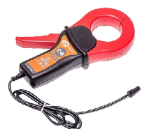
C-8 clamp probe WASONCEGC8