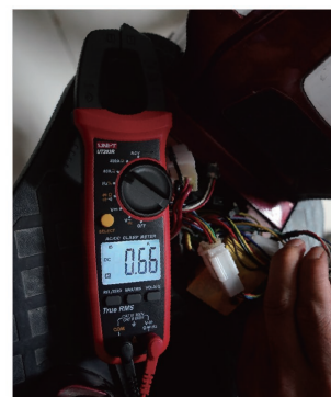
In current and voltage range measurement. Accuracy guarantee range 1%~100%