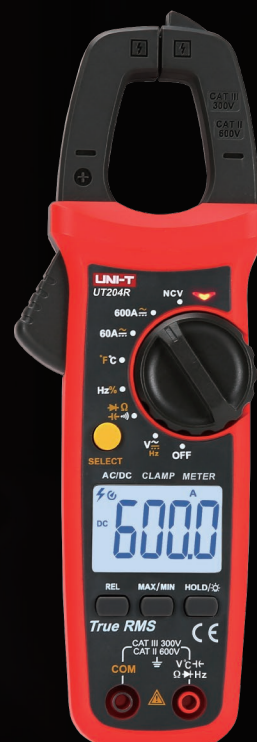
UT203R/204R (AC/DC current)