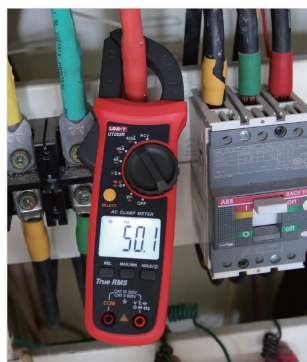
High voltage (600V) frequency measurement