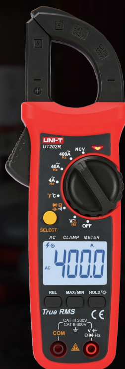
UT201R/202R/202F (AC current only)