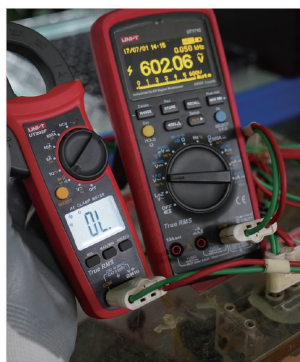
600V protection across all range