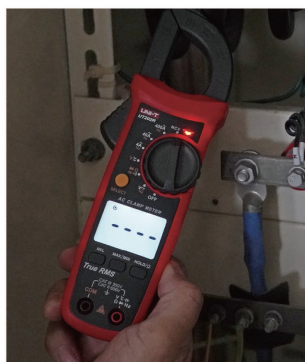
NCV multi-segment display and audio/visual alarm